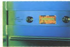
A USB port

On the rear panel of the computer there are several ports into which we can plug a wide range of peripherals – a modem, a digital camera, a scanner, etc. They allow communication between the computer and the devices. Modern desktop PCs have USB ports and memory card readers on the front panel.