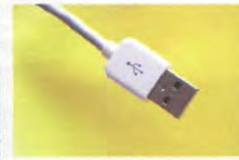
A USB connector